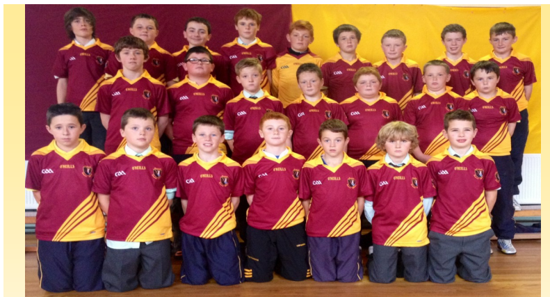
Sciath na Scol Boys And Girls!